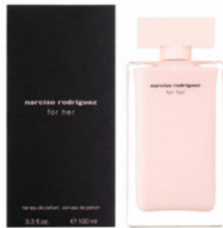
REDRIGUEZ FOR HER 100ML (PINK BOTTLE) (SCENT INSPIRED BY NARCISCO RODRIGUEZ)