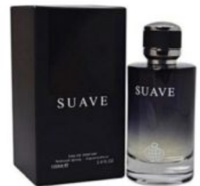
SUAVE 100ML (SCENT INSPIRED BY DIOR SAUVAGE)