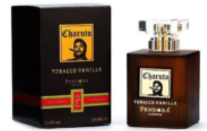
CHARUTO TOBACCO VANILLE BY PANDORA 100ML (SCENT INSPIRED BY TOM FORD TOBACCO VANILLE)