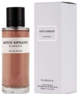
AOUD ASPHANY BY ALINA COREL 100ML (UNISEX) (SCENT INSPIRED BY DIOR OUD ISPAHAN)