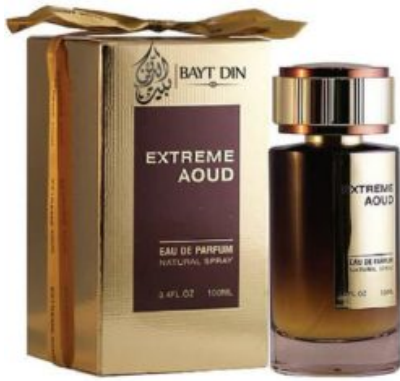
EXTREME AOD 100ML (UNISEX)