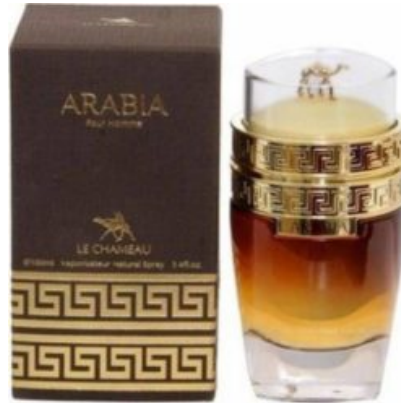
ARABIA POUR HOMME BY CHAMEAU 100ML