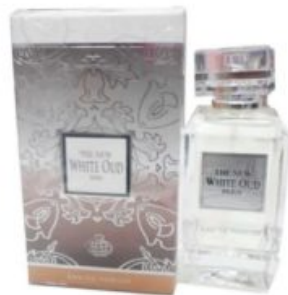
THE NEW WHITE OUD PARIS 100ML (UNISEX)