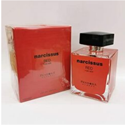
NARCISSUS RED FOR HER 100ML (SCENT INSPIRED BY NARCISO RODRIGUEZ ROUGE)