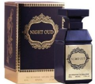
NIGHT OUD 80ML