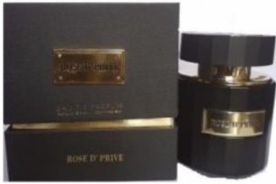
ROSE D' PRIVE 100ML (UNISEX)