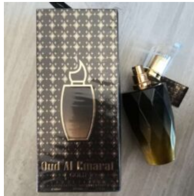
LOUD AL EMARAT GOLD 100ML (UNISEX)