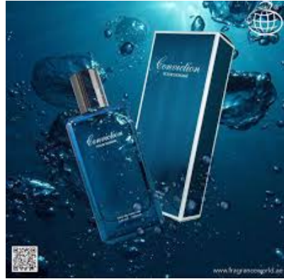
CONVICTION POUR HOMME 100ML (SCENT INSPIRED BY DAVIDOFF COOL WATER)