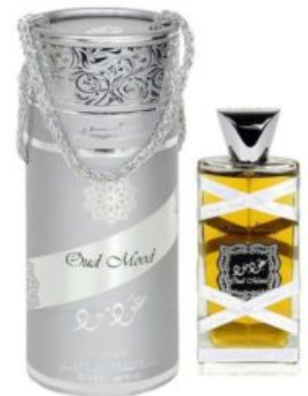
LOUD MOOD REMINISCENCE BY LATAFA 100ML (SILVER) (UNISEX)