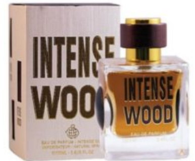
INTENSE WOOD 100ML (OUD)