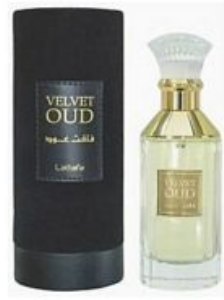
VELVET OUD BY LATAFA 80ML (UNISEX)