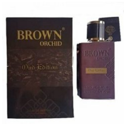
BROWN ORCHID OUD EDITION 80ML (UNISEX)