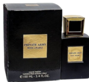
PRIVATE ARMY ROSE ARABIA 100ML (UNISEX)