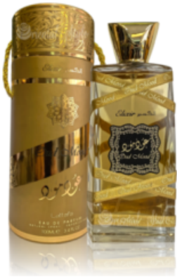
LOUD MOOD LATAFA GOLD 100ML (UNISEX)