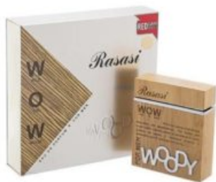
RASASI WOODY 60ML (MEN)