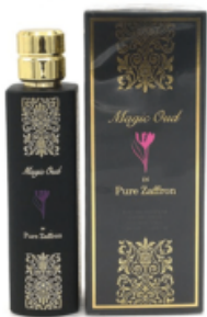
MAGIC OUD IN PURE ZAFFRON 100ML