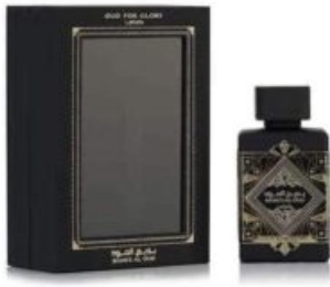
BADE'E AL OUD (OUD FOR GLORY) BY LATTAFI 100ML