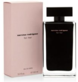
REDRIGUEZ FOR HER 100ML (BLACK BOTTLE) (SCENT INSPIRED BY NARCISCO RODRIGUEZ)