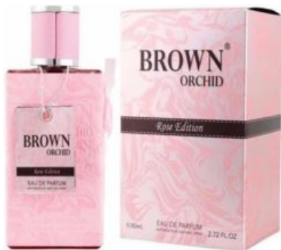
BROWN ORCHID ROSE EDITION 80ML