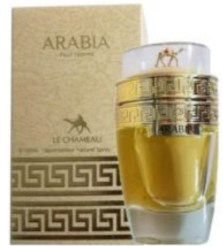
ARABIA POUR FEMME BY CHAMEAU 100ML