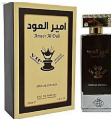
AMEER AL OUD SPECIAL EDITION 100ML (UNISEX)