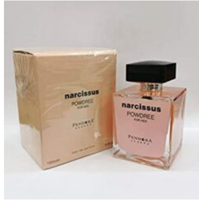
NARCISSUS POWDREE FOR HER 100ML (SCENT INSPIRED BY NARCISO RODRIGUEZ POUDREE)