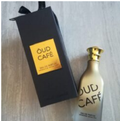
LOUD CAFE 85ML (UNISEX)