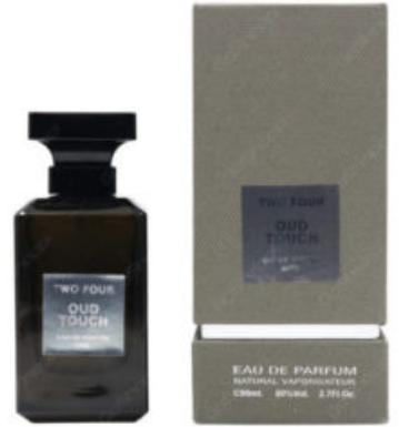
TWO FOUR OUD TOUCH 80ML (SCENT INSPIRED BY TOM FORD TOBACCO OUD)