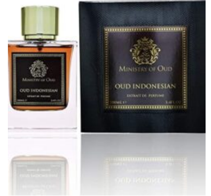
LOUD INDONESIA BY MINISTRY OF OUD 100ML