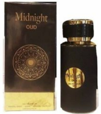
MIDNIGHT OUD 100ML