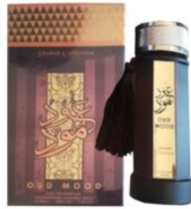
LOUD MOOD BY SHABAB COLLECTION 80ML (UNISEX)