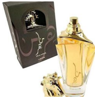
MAHIR BY LATTIFA 100ML